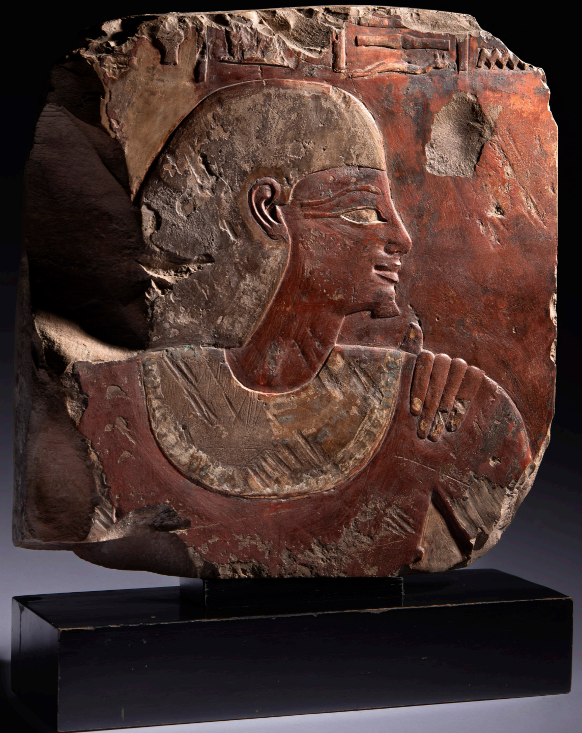
2 Relief of Hatshepsut from The Mortuary Temple of Hatshepsut, Deir el-Bahari.